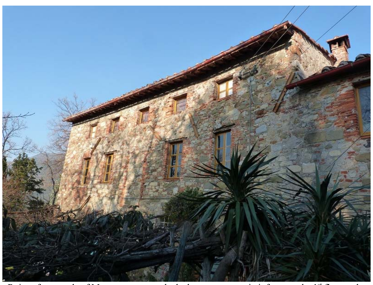
Ruins of our castle of Montemagno – we had a large apartment in it for us at the 1<sup>st</sup> floor and a family of peasants lived on the 2<sup>nd</sup> floor.